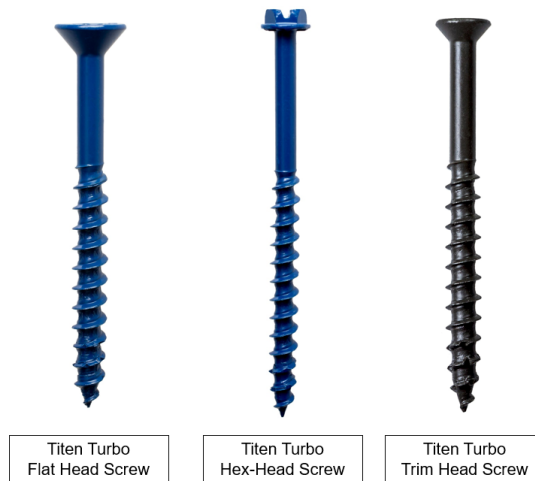
FIGURE 1 – TITEN TURBO™ SCREW ANCHORS