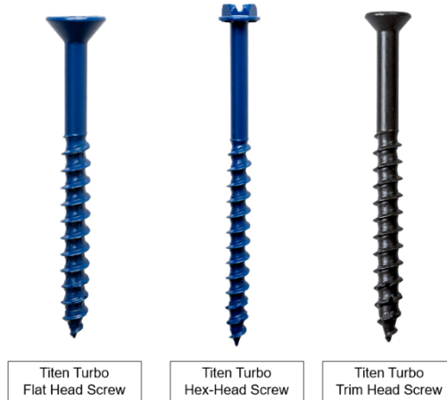
FIGURE 1 - TITEN TURBO™ SCREW ANCHORS

3 The tabulated values of \phi_{cb} and \phi_{cp} apply when both the load combinations of Section 1605.1 of the 2021 IBC, Section 1605.2 of the 2018, 2015, 2012, and 2009 IBC, ACI 318-19, ACI 318-14 Section 5.3 or ACI 318-11 Section 9.2 are used and the requirements of ACI 318-14 Section 17.3.3(c) or ACI 318-11 Section D.4.3, as applicable, for Condition B are met. If the load combinations of ACI 318-11 Appendix C are used, the appropriate value of \phi shall be determined in accordance with ACI 318-11 Section D.4.4 for Condition B.